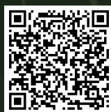
Scan QR code

Q1 (2023) CiteScore (Scopus) Best Quartile